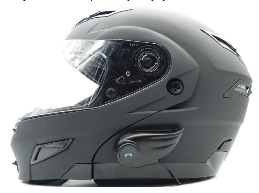
Installed F1 Headset